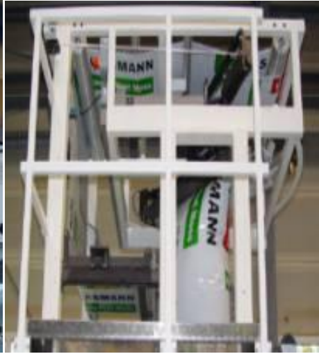
Gusset Positioning System