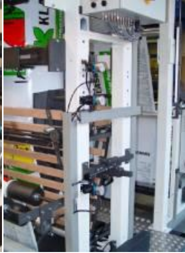
3-D Gusset Former